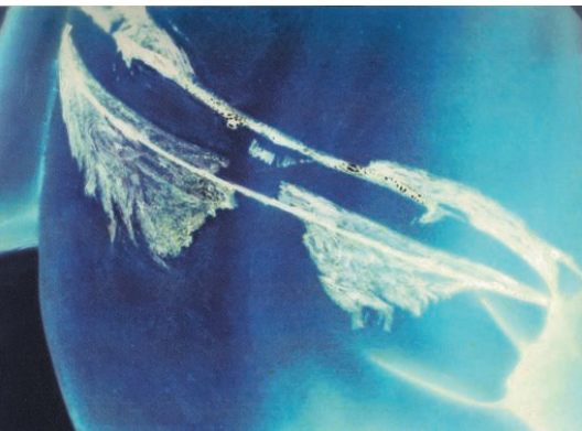
Kaethe Kauffman, Black, Blue , detail, 2003, mixed media giclee, 24 x 36"