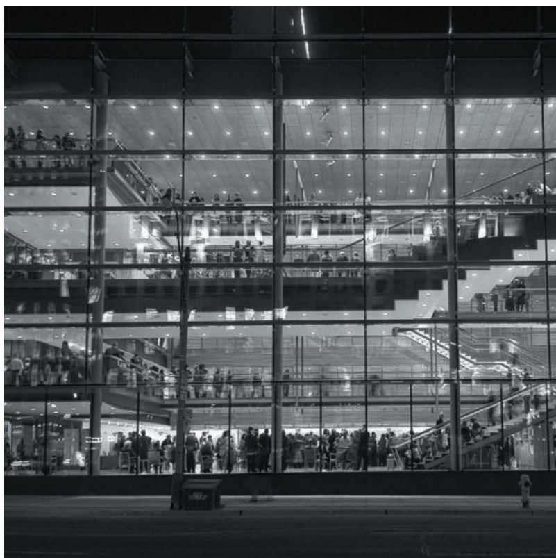
Canadian Opera Company's Four Seasons Center for the Performing Arts - Diamond and Schmitt architects.

dART INTERNATIONAL 750A St. Clair Ave. W., Toronto Ontario, Canada M6C 1B5 Tel: 416-651-5778 E-mail: info@dartmagazine.com www.dartmagazine.com