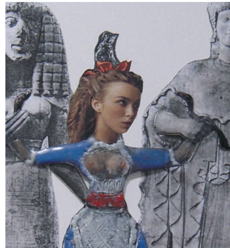
Sali Taylor, Not in Oz Anymore (detail) , 2008, collage on wood