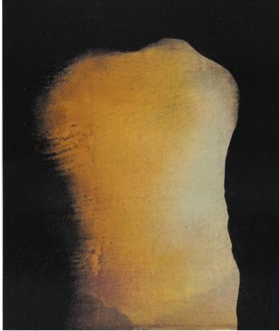
Eileen Senner, Untitled, 2005, oil on wood panel, 16 x 12"

her personal experience as a runway fashion model, affording her a unique insight into the artificial world of glitz that generates an unreal view of the celebrity world. Her detailed pencil drawings mirror the scrutiny that outward appearance is subjected to, as we measure ourselves and compete in our contest for prestige and acceptance. Beauty yields power, but the over-emphasis on its time-consuming maintenance distorts our sense of real inner value. Individual traits become magnified under such scrutiny, mirroring the disproportionate emphasis on appearance that exists in contemporary culture. With acute observation, she recreates every pouch, pock, shadow and line on her subjects' exposed faces. Instead of revealing glamour, she illuminates the personality behind the mask, defined by myriad complexities that trouble the mind and mar the calm of their facial expressions. Montvila debunks cultural falsehood in her quest for truth and reality. She delves beneath the outward façade, using detailed appearance as a vehicle to reveal inner realities. Giedre Montvila renders her pencil on paper drawings with the skill and detail reminiscent of Albrecht Dürer. Her disillusion with falsely glamorized images is transformed into a highly personal expose of not only the appearance, but also the character, personality and psychic turmoil she unearths in her subjects. In Lost Child ,